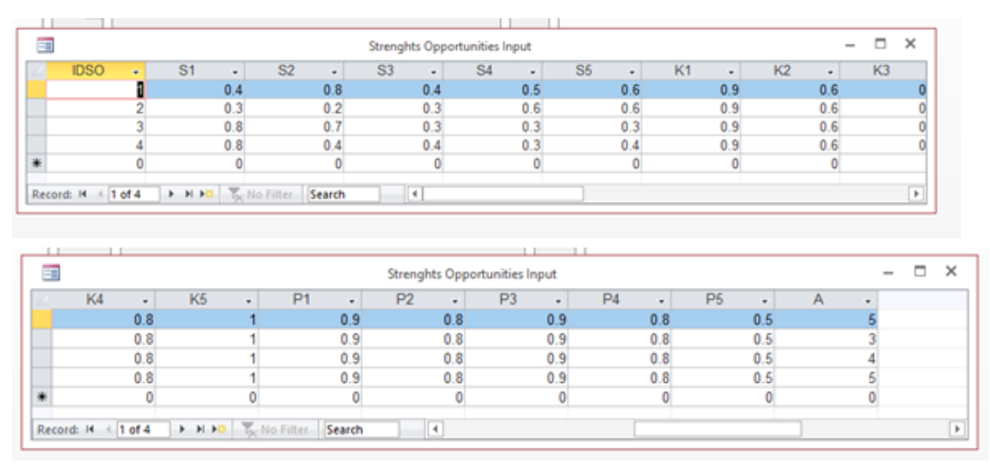
Figure 3. Form for entering initial values Strenghts Opportunities

The basis of the calculation of the displayed program is based on the SQL language. SQL language is a universal language for accessing relational databases. This approach allows data manipulation over databases from software developed on different platforms and different programming languages. This enables the use of universal program code of all budget segments by switching to new software solutions. The following listing shows one of the key segments of the budget related to the SWOT matrix of Strengths Opportunities. The calculation for other segments of the matrix is performed analogously.