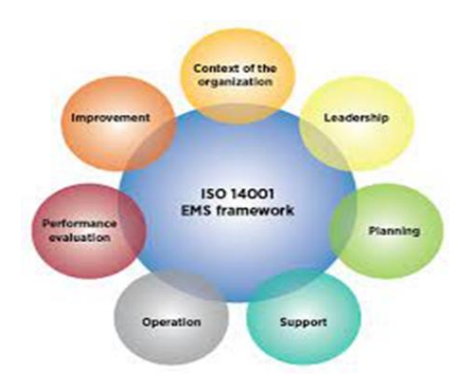
Figure 1. ISO14001 (https://asq.org/quality-resources/iso-14001)

The quality of environmental analysis and strategic decision making in environmental management can be significantly improved decision software support. understood that software support can significantly facilitate the strategic orientation of environmental management in Serbia, offering a very quick comparative overview of the relationship between environmental factors different alternatives, with different impacts and probabilities, in order to draw parallels and adopt the most favorable strategic decision.