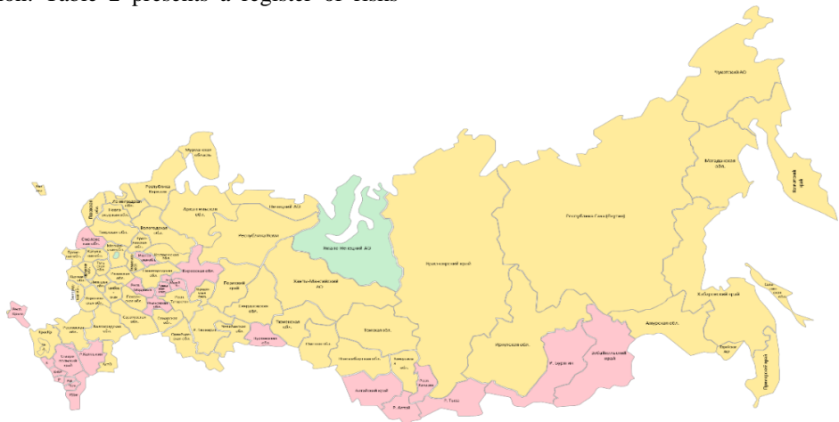
Figure 1. Heat map according to the projection "Social security" in the context of the members of the Russian Federation for 2020

and threats to the security of the ecosystem of the Kirov region in 2020 using subprojections as an example. The color scheme of the subprojections characterizes the degree of the security system development, and the security and threat indicators characterize the qualitative level of danger (low, medium, or high). Comparison of the current level of the security of the regional ecosystem with the baseline reflects the state of stability and makes it possible to assess the change in the security of the regional ecosystem compared to the base period. Figure 3 presents the digital portrait of the sustainability of the ecosystem of the Kirov region in 2020 and, on its basis, the register of risks and threats to the sustainability of the ecosystem of the Kirov region was compiled (table 3).